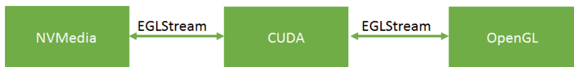
Figure 3 EGLStream Pipeline

The EGLStream pipeline is illustrated in Figure 3.